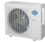
18K, 24K & 30K BTU/hr condensing units