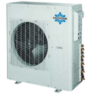
36K & 42K BTU/hr condensing units