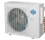
18K, 24K & 30K BTU/hr condensing units